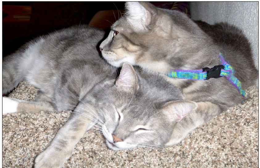
These two unrelated adult male cats enjoying a quiet nap together exhibit the less territorial, competitive, and aggressive behavior of neutered males, compared to intact male cats.