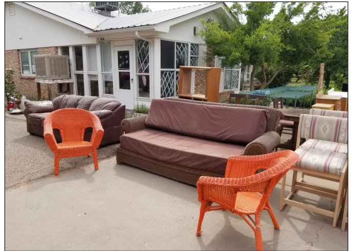
APAS yard sale, 2021.

Dorothy provided us with space to store unsold items from year to year as well as to accumulate new donations during the months between sales. Finding a new location with similar accommodations is a tall order, and we've been making inquiries around town for many months. At the very least APAS needs a space where we would be allowed perhaps 2 weeks to accumulate, sort, and price merchandise before the sale, 2 days for the sale, and about 1 week for moving unsold items to a more permanent storage area after the sale. In addition to needing flexibility for the event schedule and security for our merchandise for 3 to 4 weeks, we must remember that the money we may have to pay as a rental fee is money